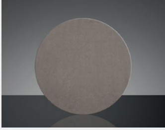
Metal-bonded diamond grinding pad PLATO