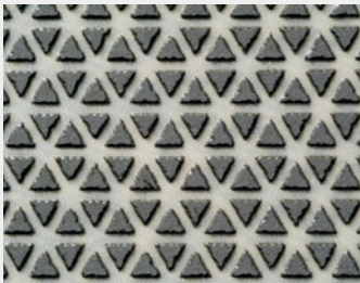
Close-up grinding Pad PLATO