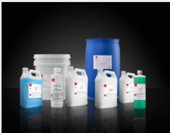
Pureon offers a variety of slurries in a wide range of viscosities and custom formulations to match MH polishing pads. We are happy to assist you in finding the best suitable products.