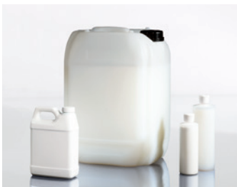
Pureon ready-to-use slurries are available in customer-tailored formulations in a wide range of viscosities.