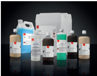
Pureon ready-to-use slurries are available in customer-tailored formulations in a wide range of viscosities.

Base material .....Colloidal silica Shelf life.....12 months Applications .....Ceramic, gallium arsenide, germanium, indium phosphide, lithium niobate, lithium tantalate, silicon, zerodur