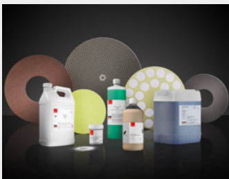
Pureon offers a wide range of customized solutions. Get in touch with us.