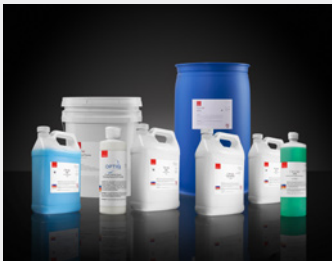
Pureon ready-to-use slurries are available in customer-tailored formulations in a wide range of viscosities.