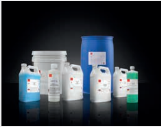
Pureon offers a variety of slurries in a wide range of viscosities and custom formulations to match MH polishing pads. We are happy to assist you in finding the best suitable products.