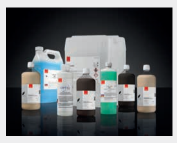
Pureon offers a variety of slurries in a wide range of viscosities and custom formulations to match SUBA™ pads. We are happy to assist you in finding the best suitable products.