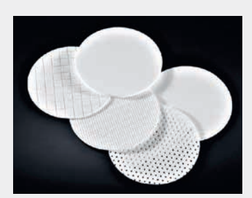
SUBA™ X is available in plain, embossed, or perforated versions to achieve the desired slurry flow.