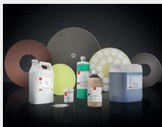
Pureon offers a wide range of customized solutions. Get in touch with us.