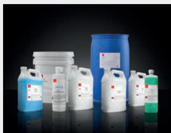
Pureon ready-to-use slurries are available in customer-tailored formulations in a wide range of viscosities.