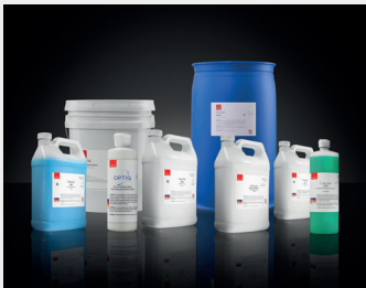
Pureon offers a variety of slurries in a wide range of viscosities and custom formulations to match SUBA™ pads. We are happy to assist you in finding the best suitable products.