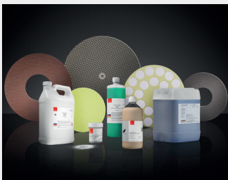
Pureon offers a wide range of customized solutions. Get in touch with us.