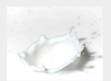
ULTRA-SOL® OPTIQ PRO final polishing slurry achieves surface finishes under 5 A on many different optical materials.