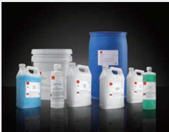
Pureon ready-to-use slurries are available in customer-tailored formulations in a wide range of viscosities.