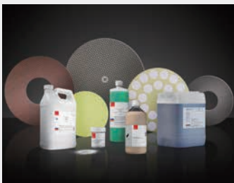
Pureon offers a wide range of customized solutions. Get in touch with us.