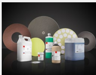
Pureon offers a wide range of customized solutions. Get in touch with us.