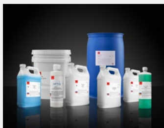
Pureon ready-to-use slurries are available in customer-tailored formulations in a wide range of viscosities.